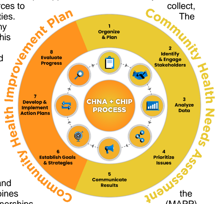
Figure 1: AHER CHNA combined process

The community health needs assessment and health improvement planning process combines mobilizing action through planning and partnerships engaging patients and communities is health assessments, and community health improvement navigator frameworks to ensure it meets the required needs of all partner organizations involved.